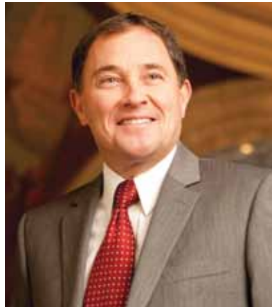
GARY R. HERBERT Utah Governor