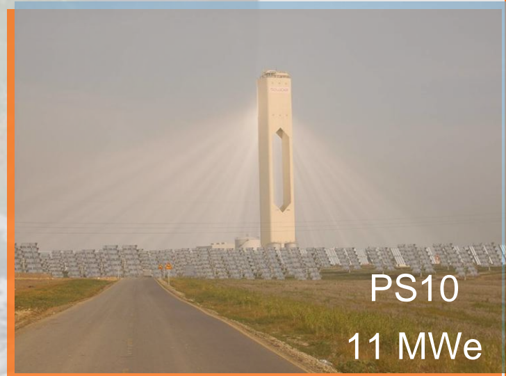
PS10 11 MWe