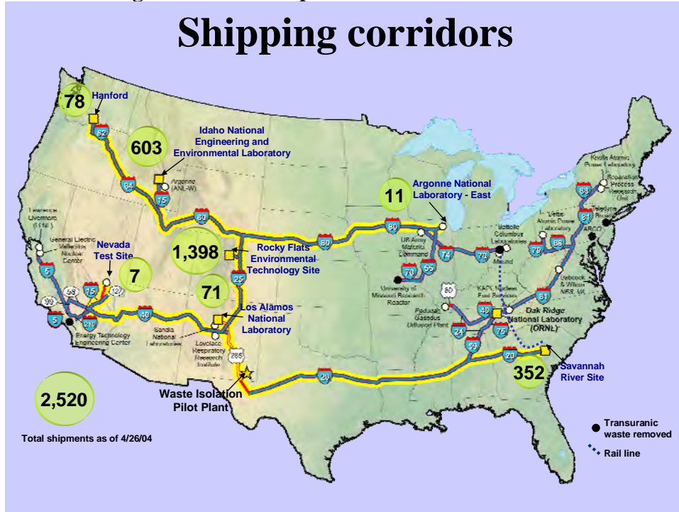
Figure 2. Total Shipments and Routes Followed