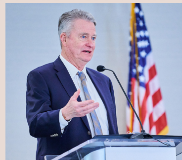
Idaho Gov. Brad Little

The Governor emphasized the opportunities provided by the Infrastructure and Jobs Act and the American Rescue Plan Act (ARPA) to fund projects that advance these priorities: