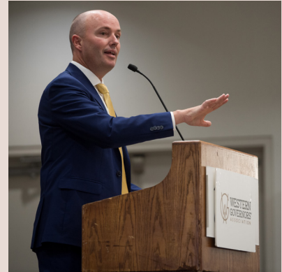
Utah Gov. Spencer Cox

He called attention to a pilot project that the Utah Department of Natural Resources and the U.S. Forest Service led on Monroe Mountain in the Fish Lake National Forest. With the help of local stakeholders and landowners, the project successfully thinned thousands of acres of forest that had been overrun by invasive conifer trees using prescribed fire and mechanical treatments. In just a few short years, the native aspen stand had been revived,